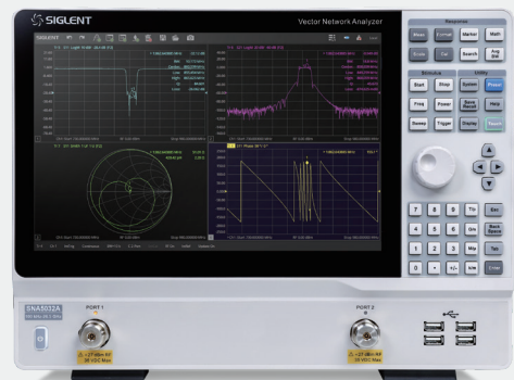
Vector Network Analyzer