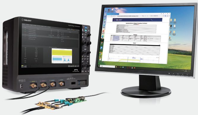
Oscilloscope (SDS7000A) & Software & Fixture