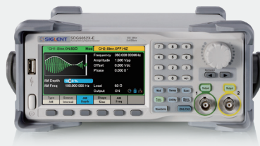
Arbitrary Waveform Generator